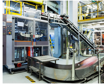
Automation and Control