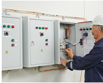
Main Power Indication