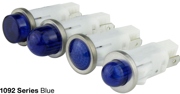
1092 Series Blue

VCC's team worked with the client to deliver a standard solution that met the client's high standards for the Power Drop design: