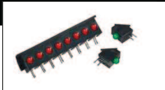
3mm PC Board Mount LEDs