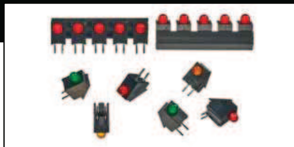
3mm PC Board Mount LED