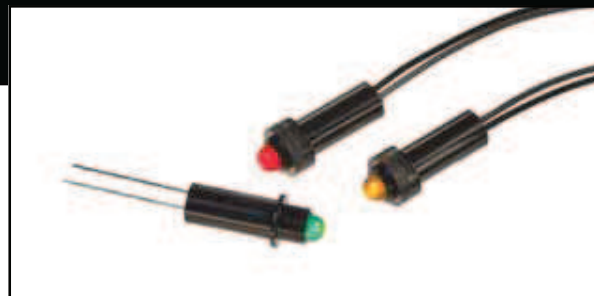
5mm Panel Mount LED Assemblies