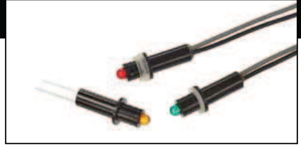
3mm Panel Mount LED Assemblies