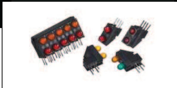
3mm PC Board Mount LEDs