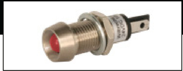
5mm Panel Mount LED Assemblies