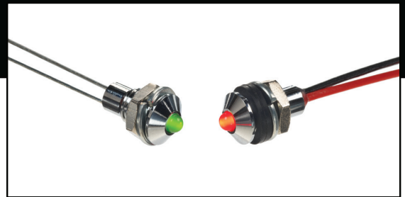
3mm Panel Mount LED Assemblies