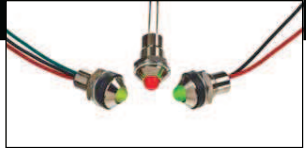
5mm Panel Mount LED Assemblies