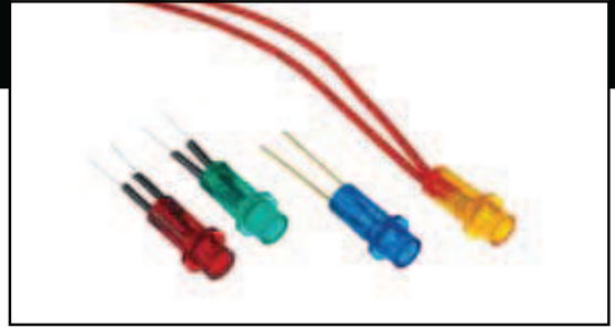
Panel Mount Incandescent/Neon Indicators