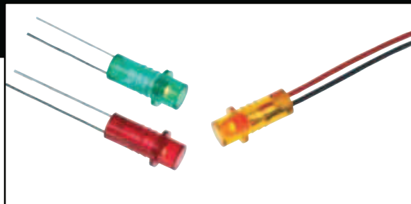
3mm Panel Mount LED Assemblies