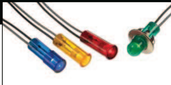
5mm Panel Mount LED Assemblies