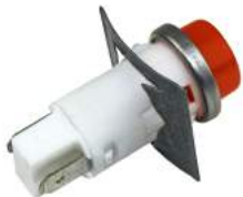
Speed nut accessory

Featuring a bezel finish and polished stainless steel, the 1092 Series is compliant with RoHS and REACH requirements.