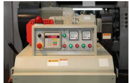
Heavy Industrial Machines