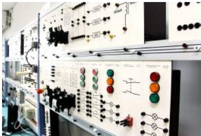
Automation and Control